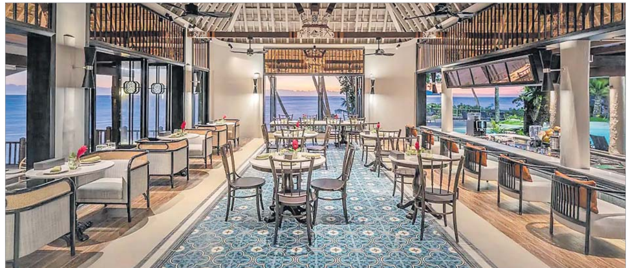
The congress will held on June 23 and 24, 2023, at the Shangri-La Yanuca Island, Fiji in Sigatoka.